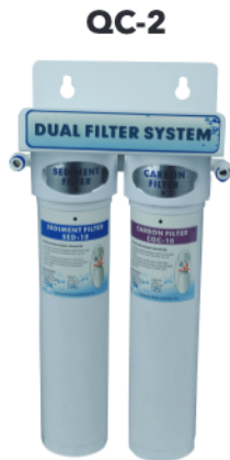
6.3" w x 3.9" d x 13.4" h