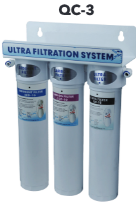
11.8" w x 4.5" d x 14.3" h