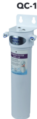
2.8" w x 3.2" d x 12.4" h