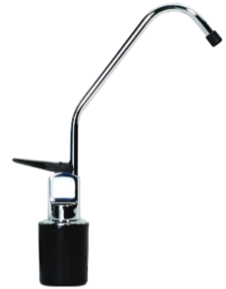
Standard chrome faucet included. Designer faucets available.